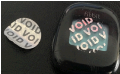
Figure 2: The Fitbit Zip activity tracker, showing a removed tamper-evident sticker. The sticker was applied to all devices used in groups 1 and 2, immediately after set-up. Each sticker was printed with the participant number to prevent participants replacing the sticker.

each year are caused by physical inactivity [7]. In addition obesity, which is strongly linked to physical inactivity, is a strong risk factor for many chronic diseases [5]. Physical activity policies and guidelines exist in many countries and are often accompanied with educational advertising campaigns aimed at increasing activity. These campaigns may be successful in increasing awareness, but many people struggle to meet recommendations [3].